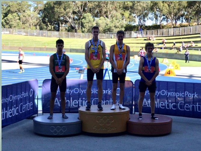
400m 15 years medal