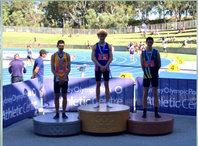
400m 14 years medal