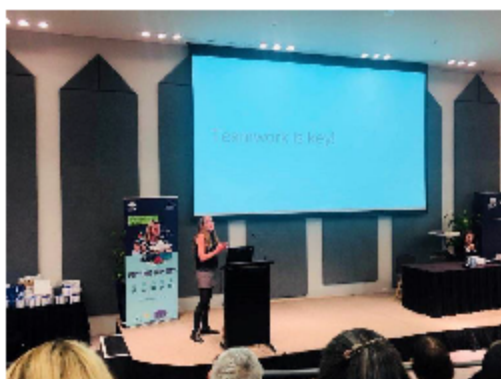
(Photos: Ms Finlayson presenting at the 2018 DE International Annual Conference)