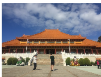
(Left: the square beneath the main shrine)

Students practiced Tai Chi under the autumn sun in the large square beneath the main shrine. An instructor demonstrated the movements, which were accompanied by traditional music and gentle commands indicating when to change position.