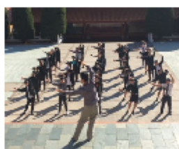
(Right and below: students practicing Tai Chi)