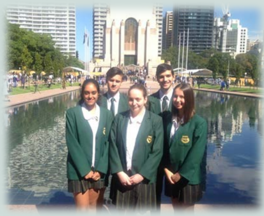
Year 11 SRC members at the War Memorial in Hyde Park, Sydney.