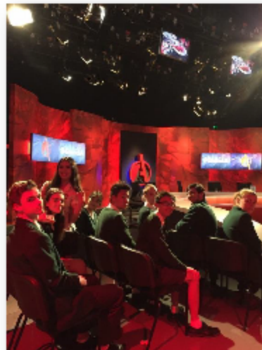
Concord High School's Senior Students at the ABC studios for the Q & A Program