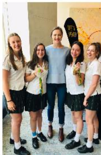
Year 12 Prefects with national swimmer, Cate Campbell