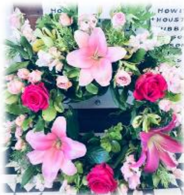
Wreath laid by Concord High School Prefects

On Sunday 11 th November 2018, the Prefects were invited to attend the Remembrance Day Service at Queen Elizabeth Park to mark the 100 th year of the Armistice. We were honoured and privileged to attend this service in memory of the servicemen and women that served in the Great War and thereafter.