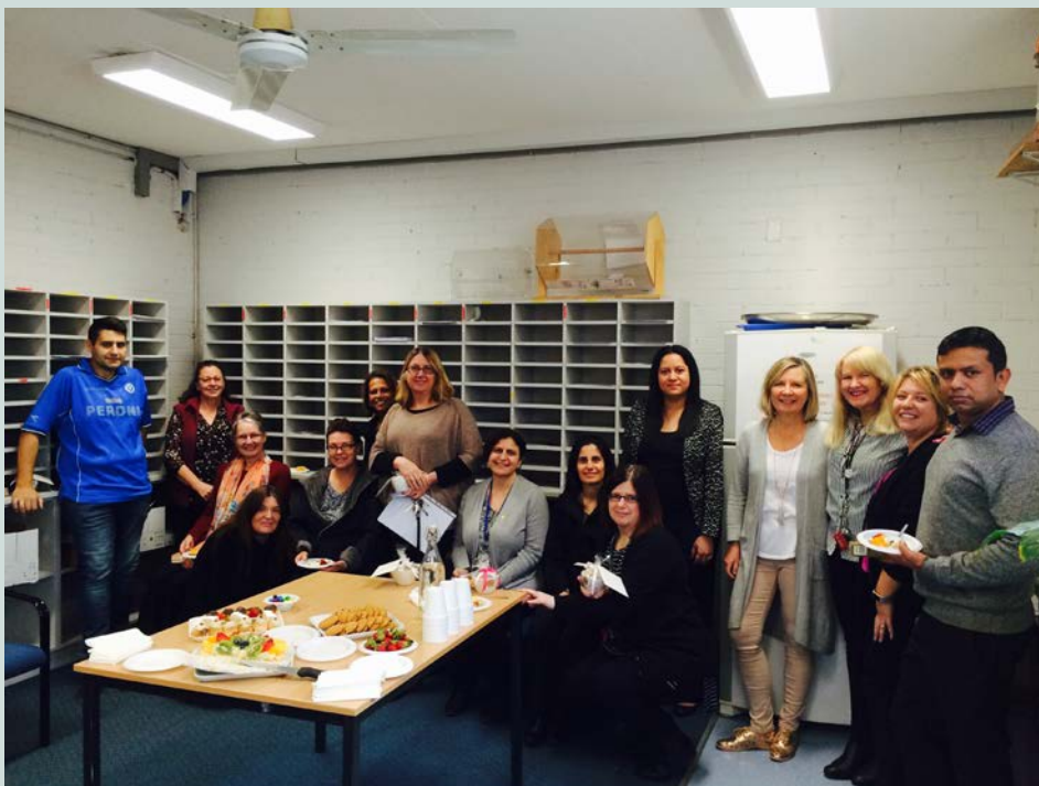
The SASS Staff

I would like to wish the Year 11 students all the very best for their Year 11 examinations which started on Thursday 7 th September and continue this week. After the examination period they will be embarking on the Year 11 Crossroads camp.