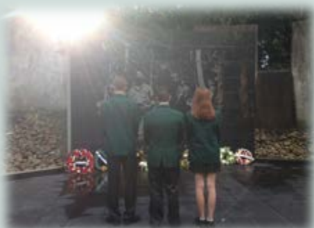
Remembering the fallen soldiers of the Second World War