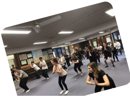
Prefects learning to stretch their mind and body

On Thursday the 22 nd June, Concord High School's Prefect body held our Prefect Afternoon Tea to engage with student leaders from the local area. The purpose of this event was to discuss the intricacies of leadership and develop new and ongoing connections with other school leaders. Students from Burwood Girls High School, Fort Street High School, Homebush Boys High School, Hunter's Hill High School, Riverside Girls High School, Rosebank College and Domremy College were able to attend the event. Our key focus was to remind ourselves and fellow student leaders about the importance of maintaining a balance between our leadership responsibilities and our personal wellbeing. This developed our theme of Leadership and Mindfulness which was further emphasised in the activities that we ran throughout the afternoon.