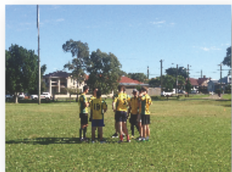
Discussing what to buy from KFC found across the road - i.e. building teamwork